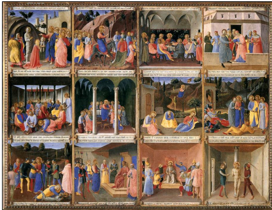
ANGELICO, Fra, Scenes from the Life of Christ 1451-52