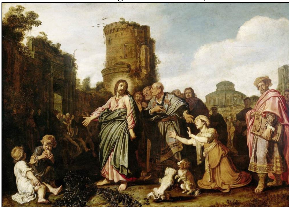
LASTMAN, Pieter Pietersz, Christ and the Canaanite Woman, 1617