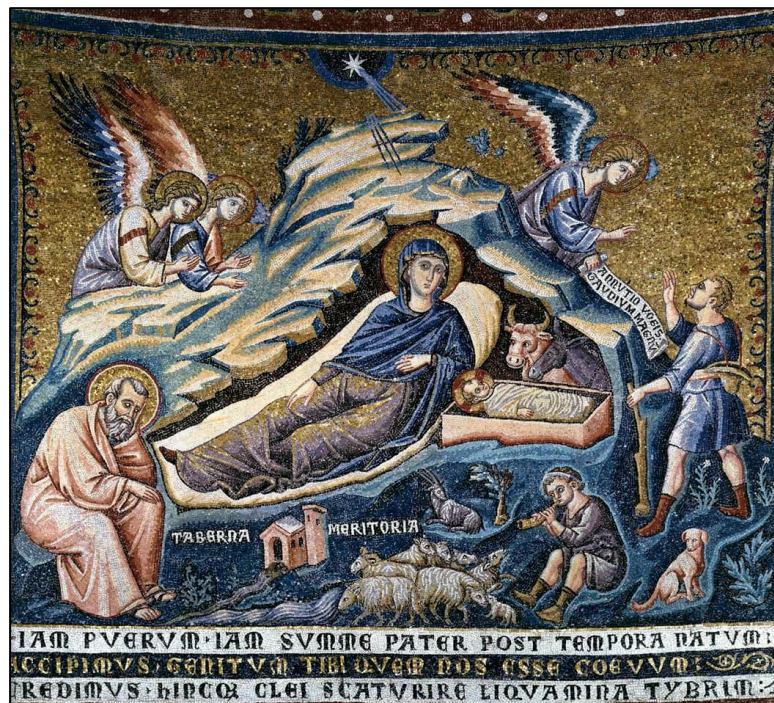
CAVALLINI. Pietro, Nativity of Christ 1296-1300