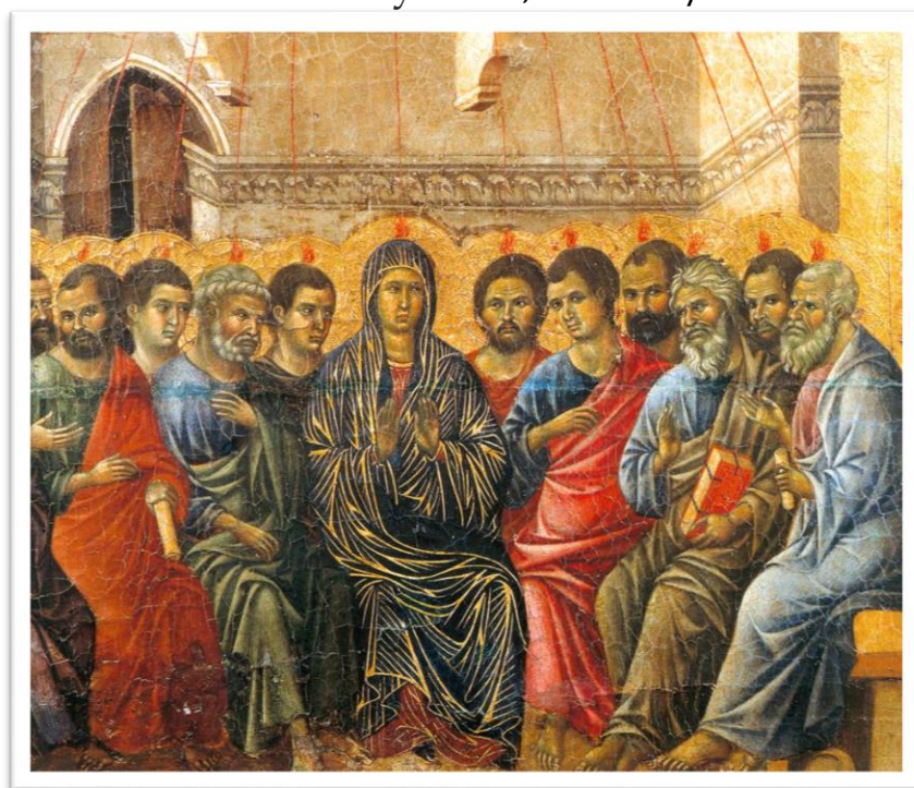
DUCCIO di Buoninsegna, Pentecost (panel 8) 1308-11