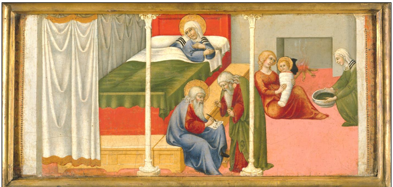
Sano di Pietro, The Birth and Naming of Saint John the Baptist 1450-60