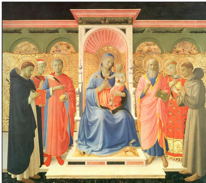
ANGELICO, Fra, Annalena Altarpiece, 1435