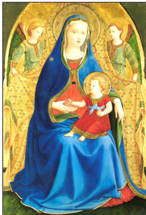
ANGELICO, Fra, Virgen de la Granada, 1395-1455