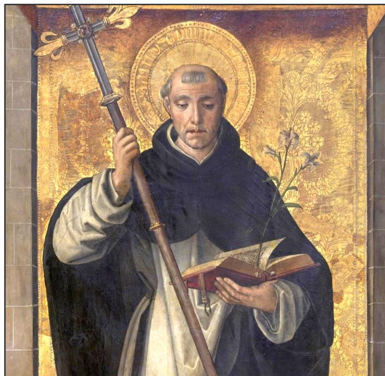
BERROGUETE, Pedro, St Dominic (Detail), Prado Museum