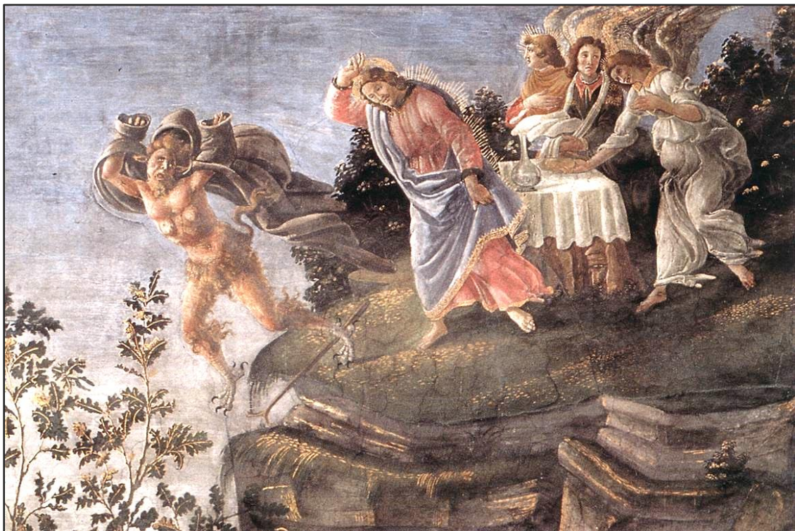
BOTTICELLI, Sandro, The Temptation of Christ (detail, 1481-82)