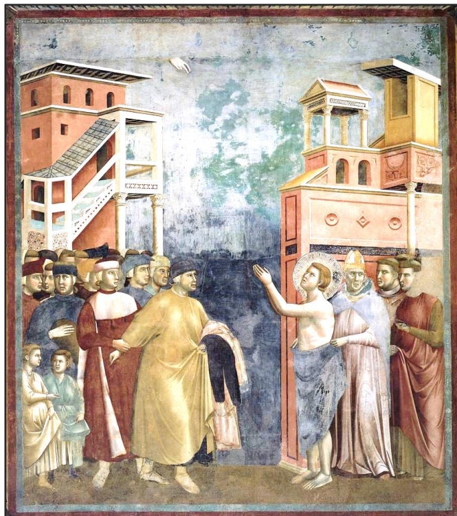
Legend of St Francis: 5. Renunciation of Worldly Goods, 1297-99