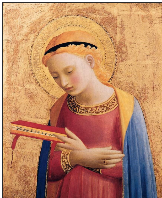
ANGELICO, Fra, Virgin Mary Annunciate, 1431-33