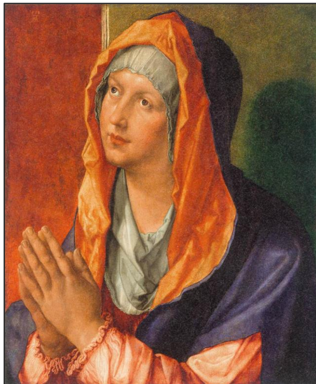
DURER, Albrecht, Virgin Mary in Prayer, 1519