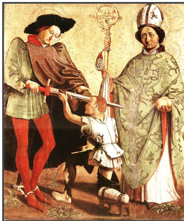
St Martin of Tours and St Nicholas of Bari, 1450