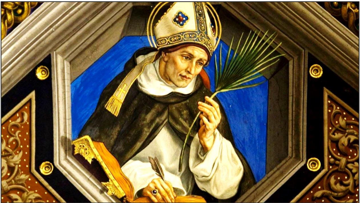
St Albert the Great