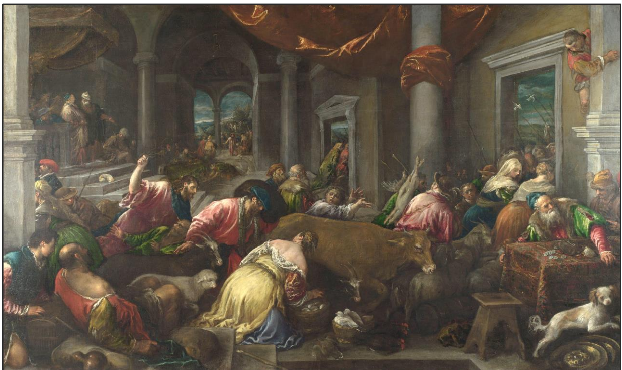
BASSANO, Jacopo, The Purification of the Temple, C. 1580