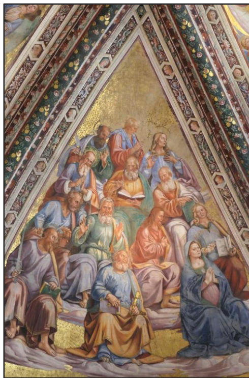
Chorus Apostolorum, Mosaic, Cathedral Orvieto