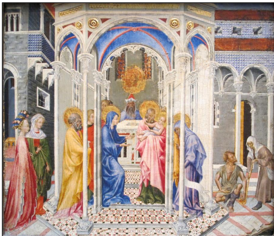
PAOLO, Giovanni di, Presentazione al Tempio, ca. 1435