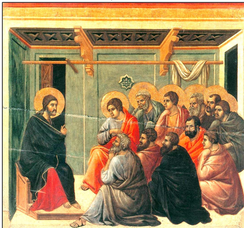
BUONINSEGNA, Duccio di, Christ Taking Leave of His Apostles, 1308-11