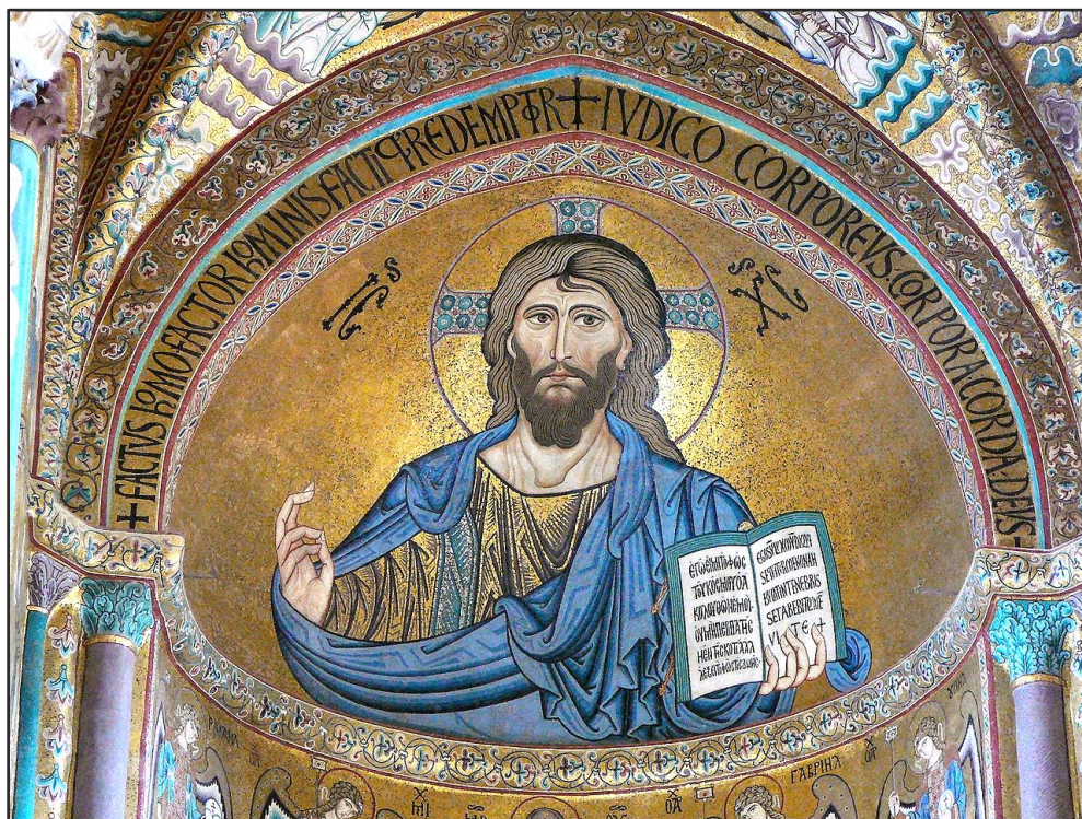
Christ Pantokrator, Righteous Judge & Lover of Mankind, Cathedral of Cefalu, Sicily