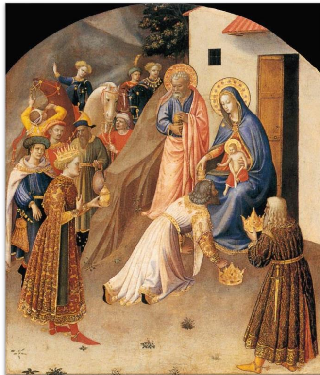
ANGELICO, Fra, Adoration of the Magi, 1423-24

Sunday Masses: Saturday Vigil: 6:00pm Live Stream Sunday: 8:30am 10:00am