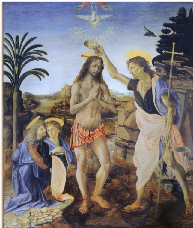
VERROCCHIO, Andrea de & DA VINCI, Leonardo, The Baptism of Christ, c. 1475