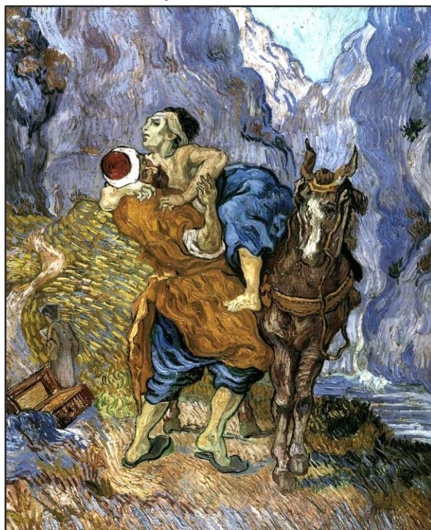
GOGH, Vincent van, The Good Samaritan, 1890