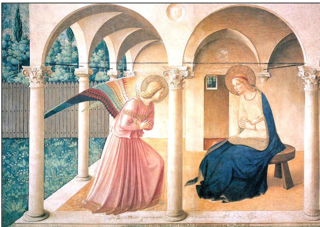
ANGELICO, Fra, Annunciation, 1442-43