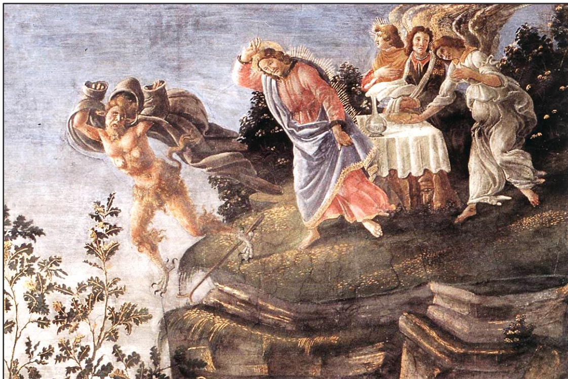
BOTTICELLI, Sandro, The Temptation of Christ (detail, 1481-82)