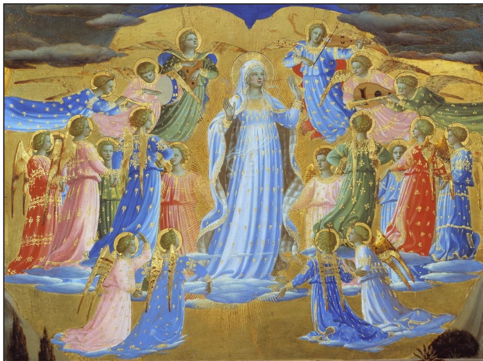
ANGELICO, Fra, Assumption of the Blessed Virgin Mary, 1432