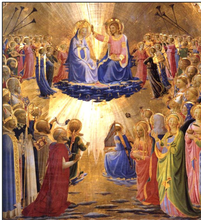
ANGELICO, Fra, Coronation of the Virgin, 1434-35