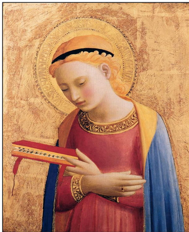
ANGELICO, Fra, Virgin Mary Annunciate, 1431-33