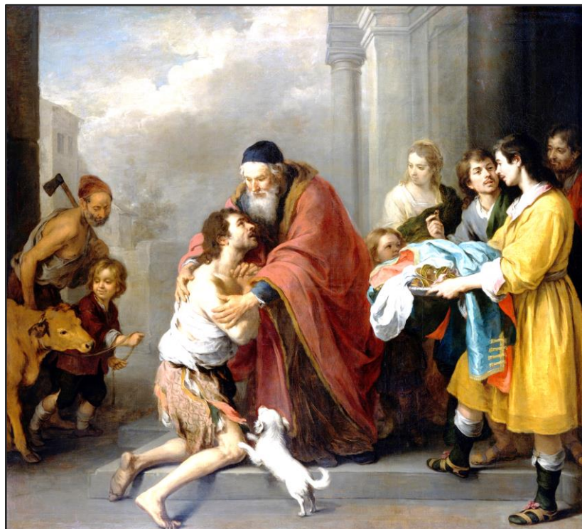
MURILLO, Bartolome Esteban, Return of the Prodigal Son, 1667-70