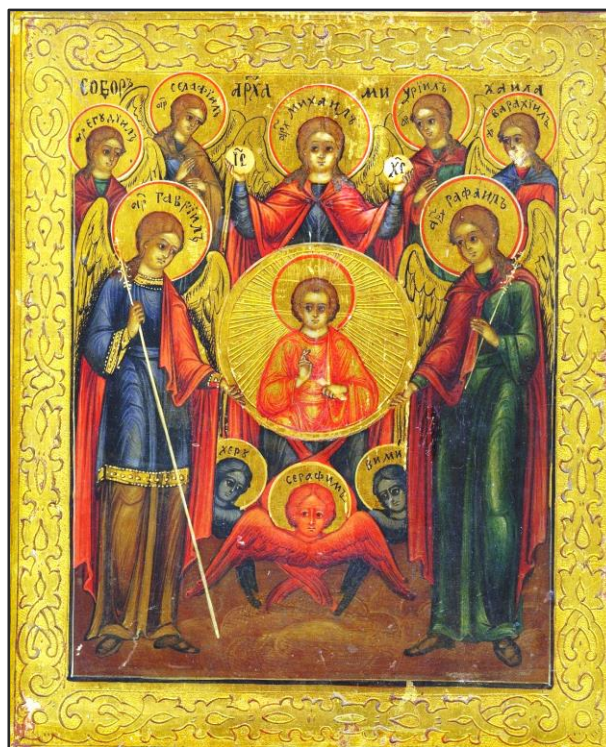
Assembly of the Archangels, XIX c.