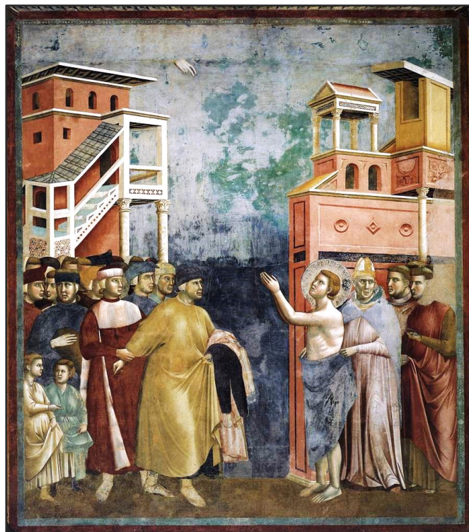
BONDONE, Giotto Di, Legend of St Francis Renunciation of Worldly Goods, 1295