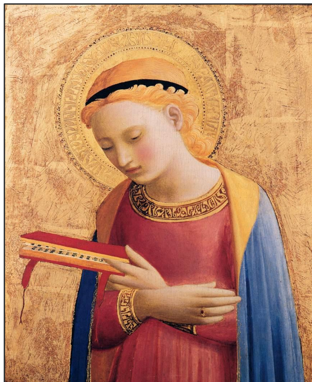
ANGELICO, Fra, Virgin Mary Annunciate, 1431-33