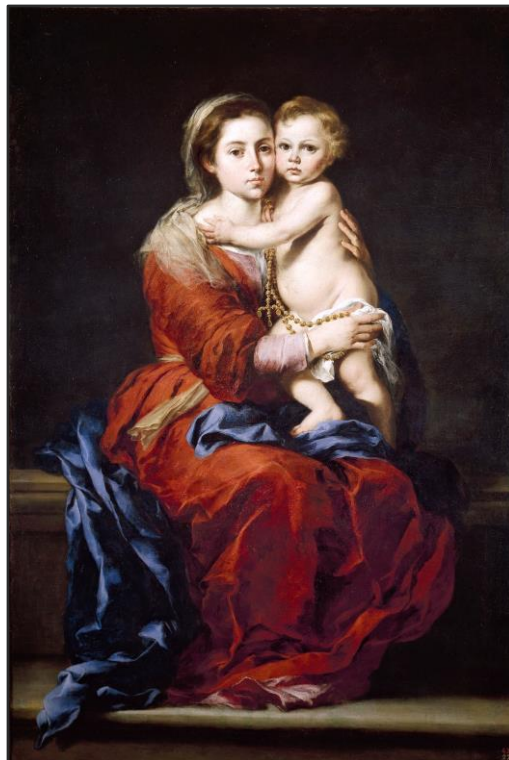
Bartolomé Esteban Murillo, Virgen del Rosario ca.1650-1655