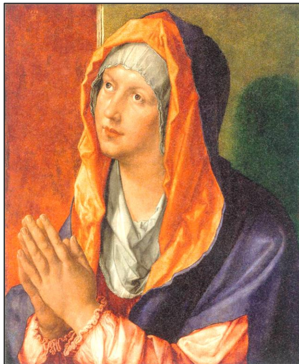
DURER, Albrecht, Virgin Mary in Prayer, 1519