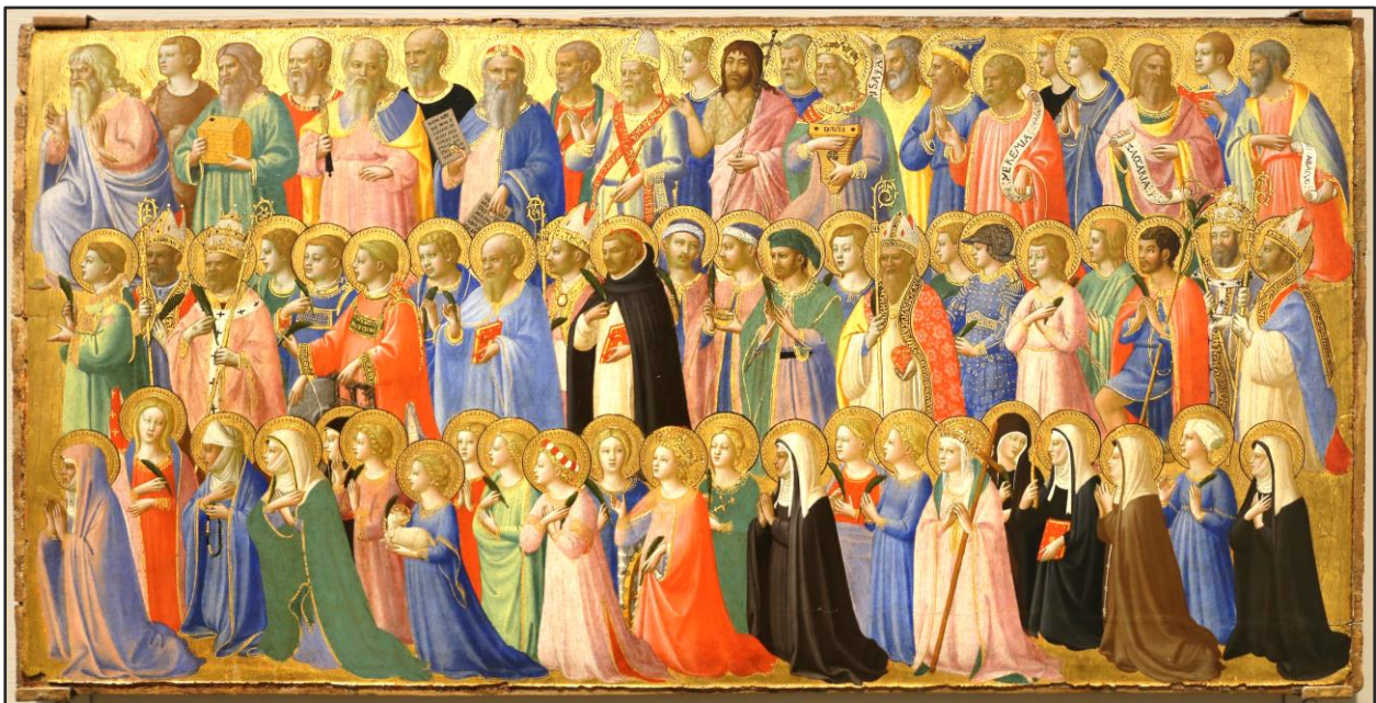
ANGELICO, Fra, Predella of the San Domenico Altarpiece Fiascole, detail, 1423-24