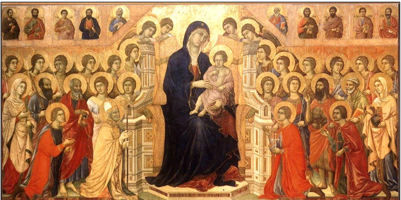
BUONINSEGNA, Duccio di, Madonna with Angels and Saints, 1308-11