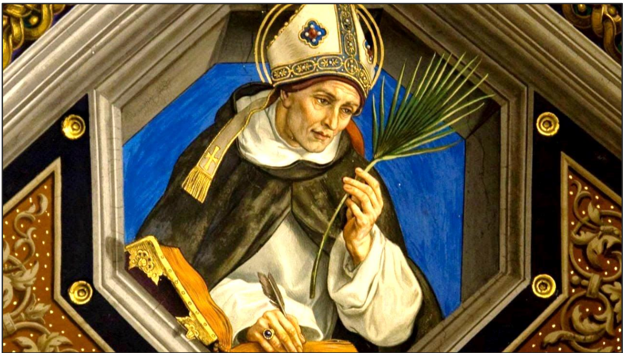
St Albert the Great