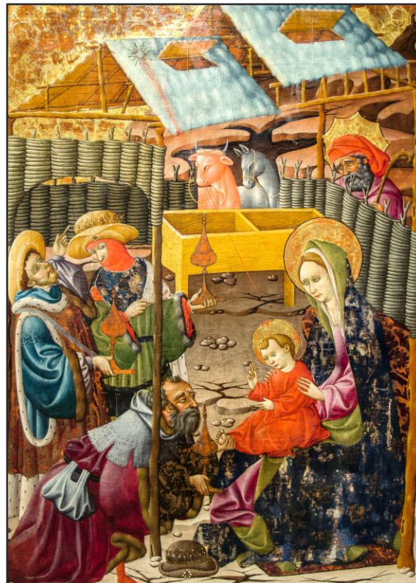
Blasco de Grañén Natividad, ca. 1459, Saragossa Museum