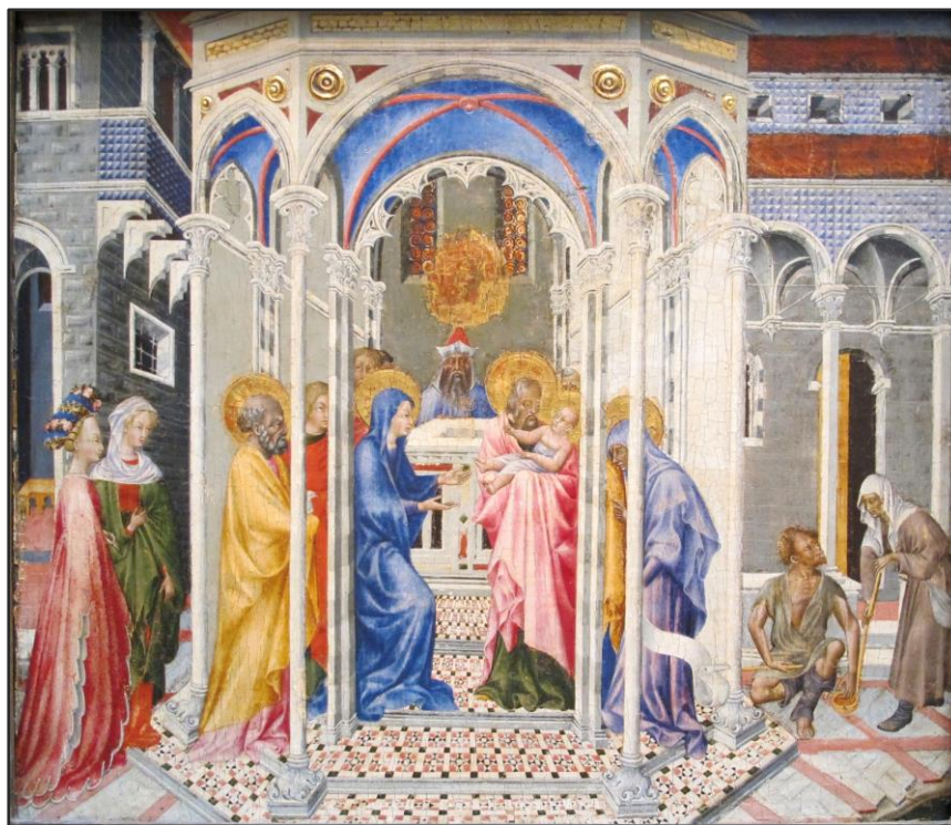
PAOLO, Giovanni di, Presentation of Christ in the Temple, ca. 1435