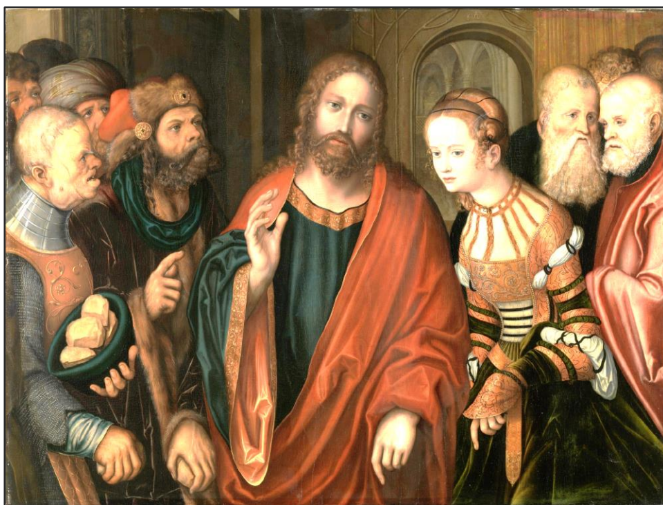
Lucas Cranach the Elder, Jesus and the woman taken in adultery ca.1520