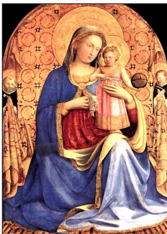
ANGELICO, Fra, Madonna and Child, 1433