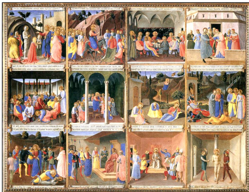
ANGELICO, Fra, Scenes from the Life of Christ, 1451-52