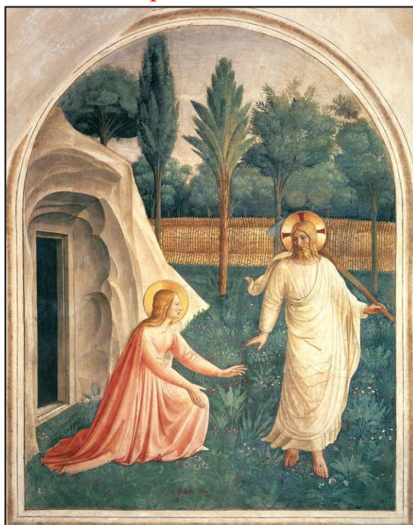
ANGELICO, Fra, Noli Me Tangere, 1440-42