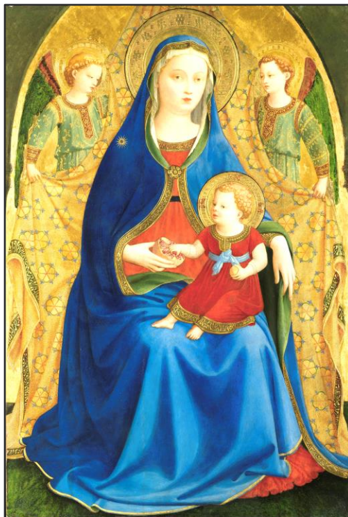
ANGELICO, Fra, Virgen de la Granada, 1426