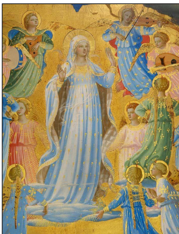
ANGELICO, Fra, The Assumption of the Blessed Virgin Mary, 1440