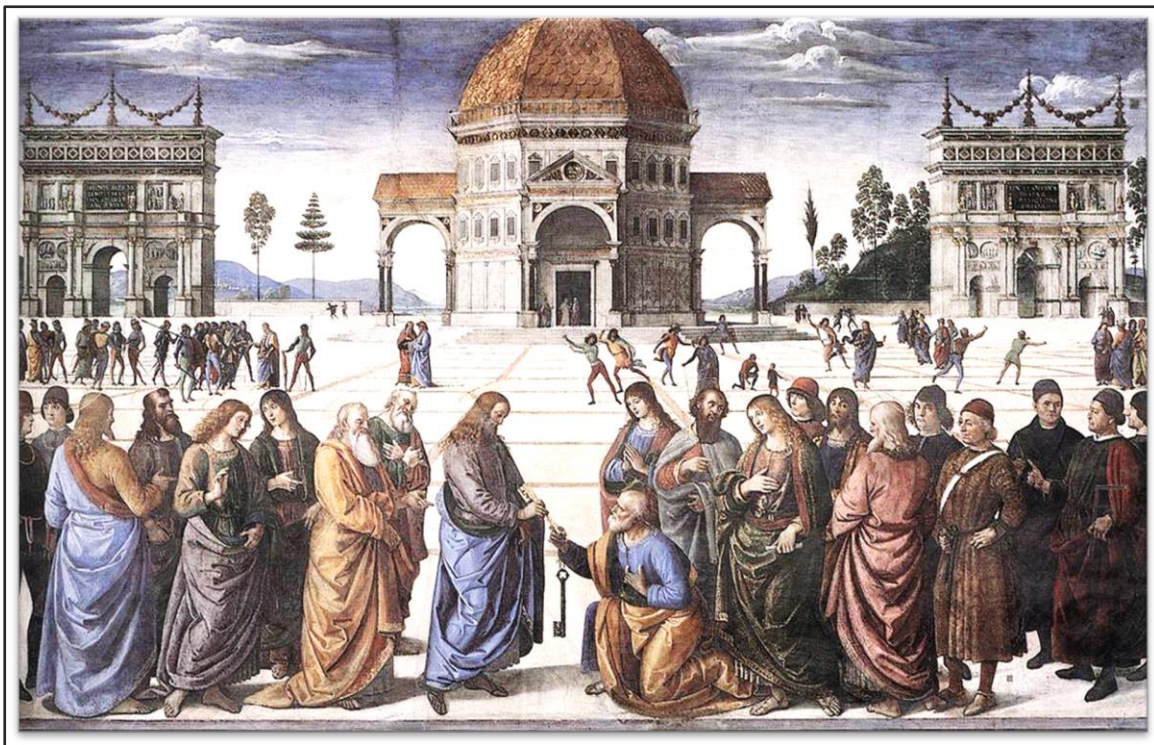
PERUGINO, Pietro, Christ Giving the Keys to Peter, Sistine Chapel, Rome