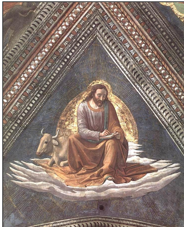
Domenico Ghirlandaio: St Luke the Evangelist 1486