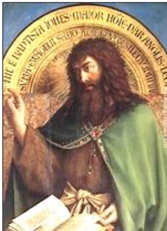
EYCK, Jan van, John the Baptist, The Ghent Altarpiece, 1425-29