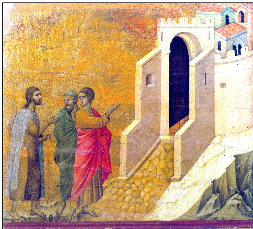
BUONINSEGNA, Duccio di, Road to Emmaus, 1308-11