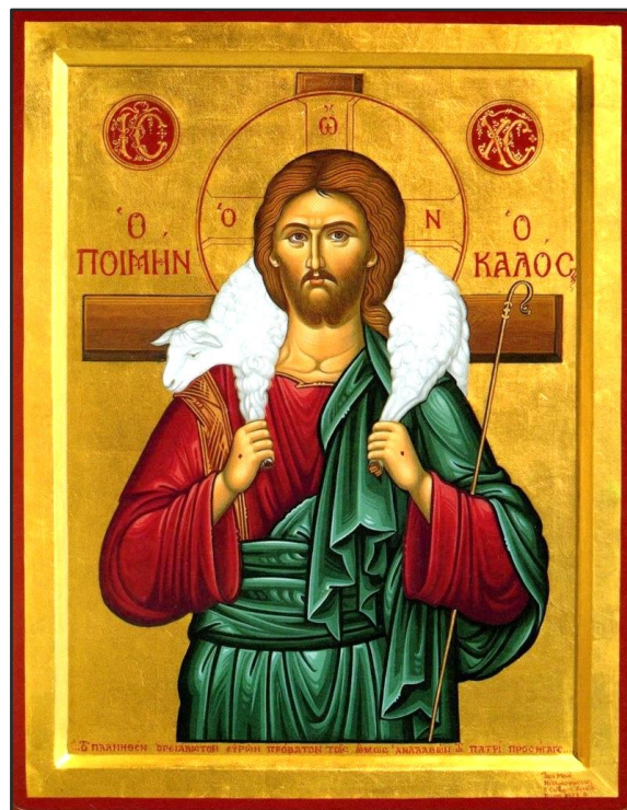
Christ the Good Shepherd Icon