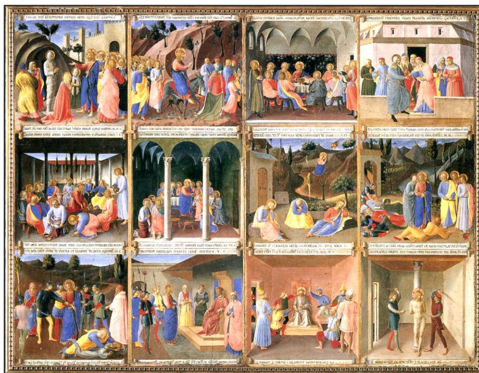
ANGELICO, Fra, Scenes from the Life of Christ, 1451-52